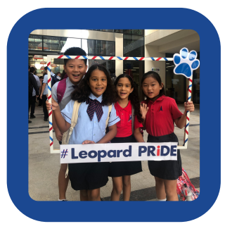
Through positive reinforcement, explicit expectations and logical consequences we foster iNTEGRITY in our students.

Apple Distinguished Schools are centers of innovation, leadership and educational excellence that use Apple technology to inspire creativity, collaboration and critical thinking.